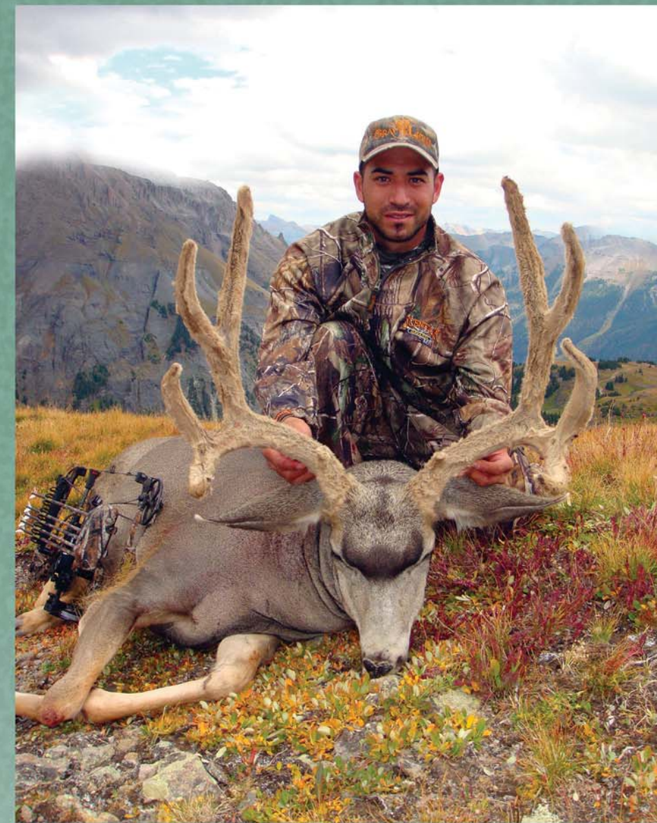
This Colorado velvet buck has deep forks and great symmetry.

to get into bow range on Elk and as I closed in on him, I ranged his antler tips at 37 yards as they bobbed up and down while he fed. I rose up with an arrow nocked and came to full draw. He was quartered away and still unaware of my presence. I placed my pin on his vitals and released; the whole time I was thinking, "He's a dead deer." As luck would have it, the arrow deflected with a loud CAAAACK off the rock outcropping in front of me 12 feet away. I could see Elk's body and legs down to his hocks slightly downhill from my height of eye. However, upon release the arrow didn't have clearance to make it over the rock! That silly mistake cost me big; yet another lesson learned to put away in the vault of knowledge. That was my last encounter with Elk as he shed his velvet the next day and left the high country for the vast stands of dark timber below.