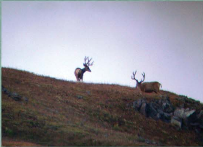
The symmetrical 4x4 hung around with 12 other bucks including a big 3x3.

daily. There were still two shooters in the group hanging around and one of those happened to be the second largest buck on the mountain. He was a great typical with deep forks and great symmetry. It was time for me to try and do what I had gone there for.