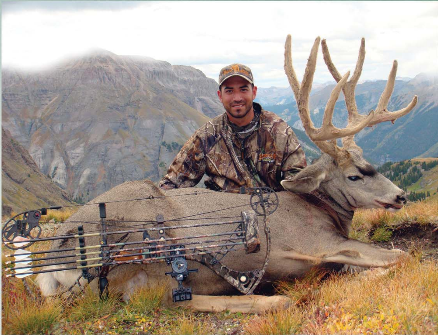
The author shot his buck in the high country of Colorado.